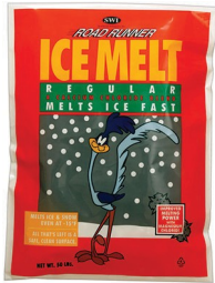
Road Runner Blend Bag

There are no added handling charges for pallet delivery