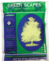
Green Scapes Bag