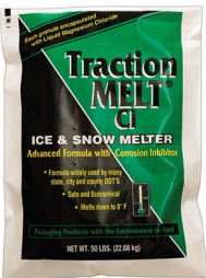
Traction Melt Bag